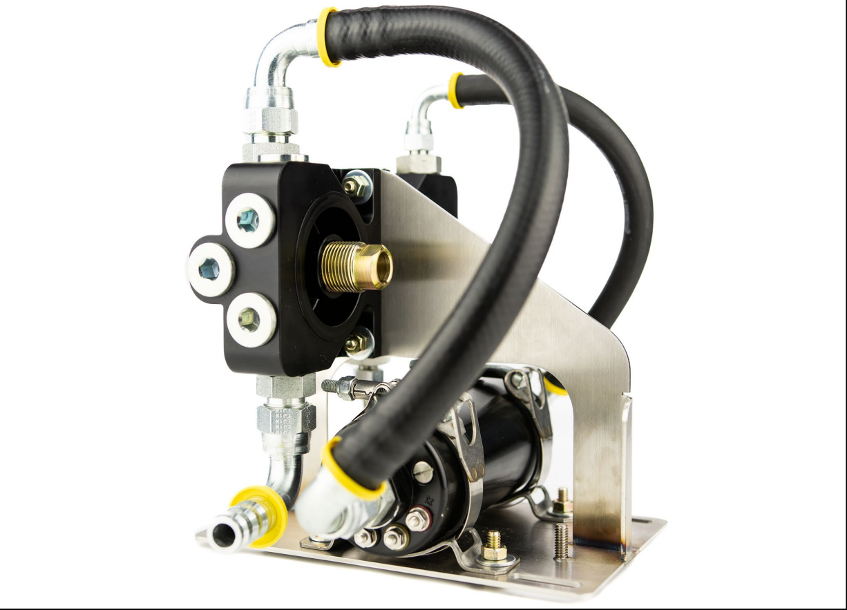
Figure 3 – Pump Inlet View – "Inside the Frame" Orientation

Figure 2 – Pump Inlet on Left – Pump Outlet on Right – "Inside the Frame" Orientation